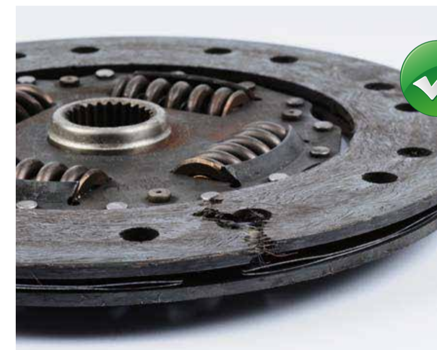
Broken friction pad