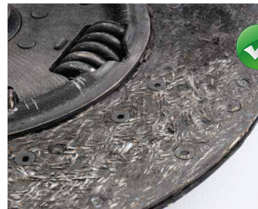
Burnt friction pad