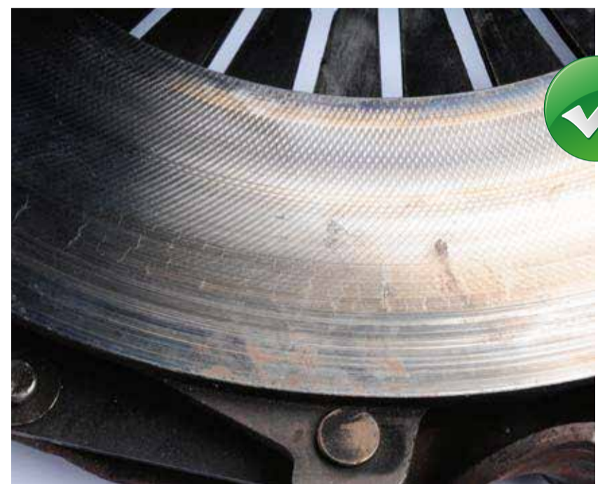
Cracked pressure disc