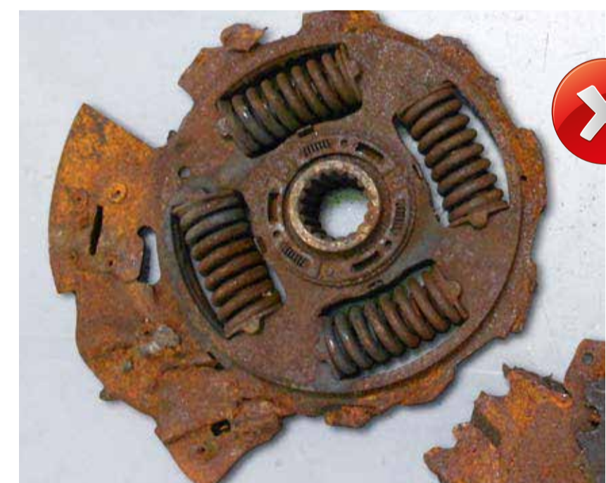
The part is heavily corroded