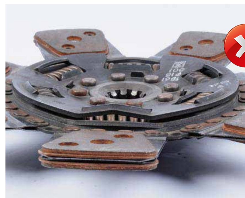
Separated clutch disc with hit the hub