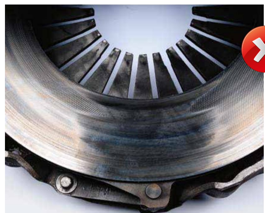
Overheated pressure disc