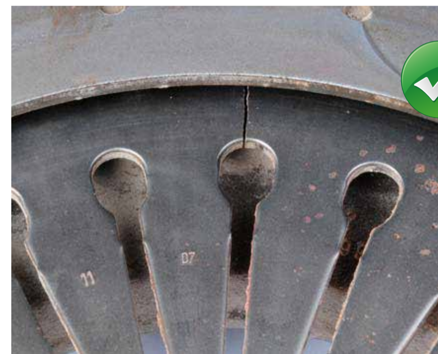
Broken diaphragm spring

Return in original packaging is mandatory! If you don't have the original packaging, returning is not possible. To make the return easier and safer, send the old part in the original packaging of the new spare part.